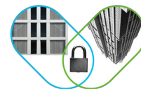
Volume and complexity of security tools